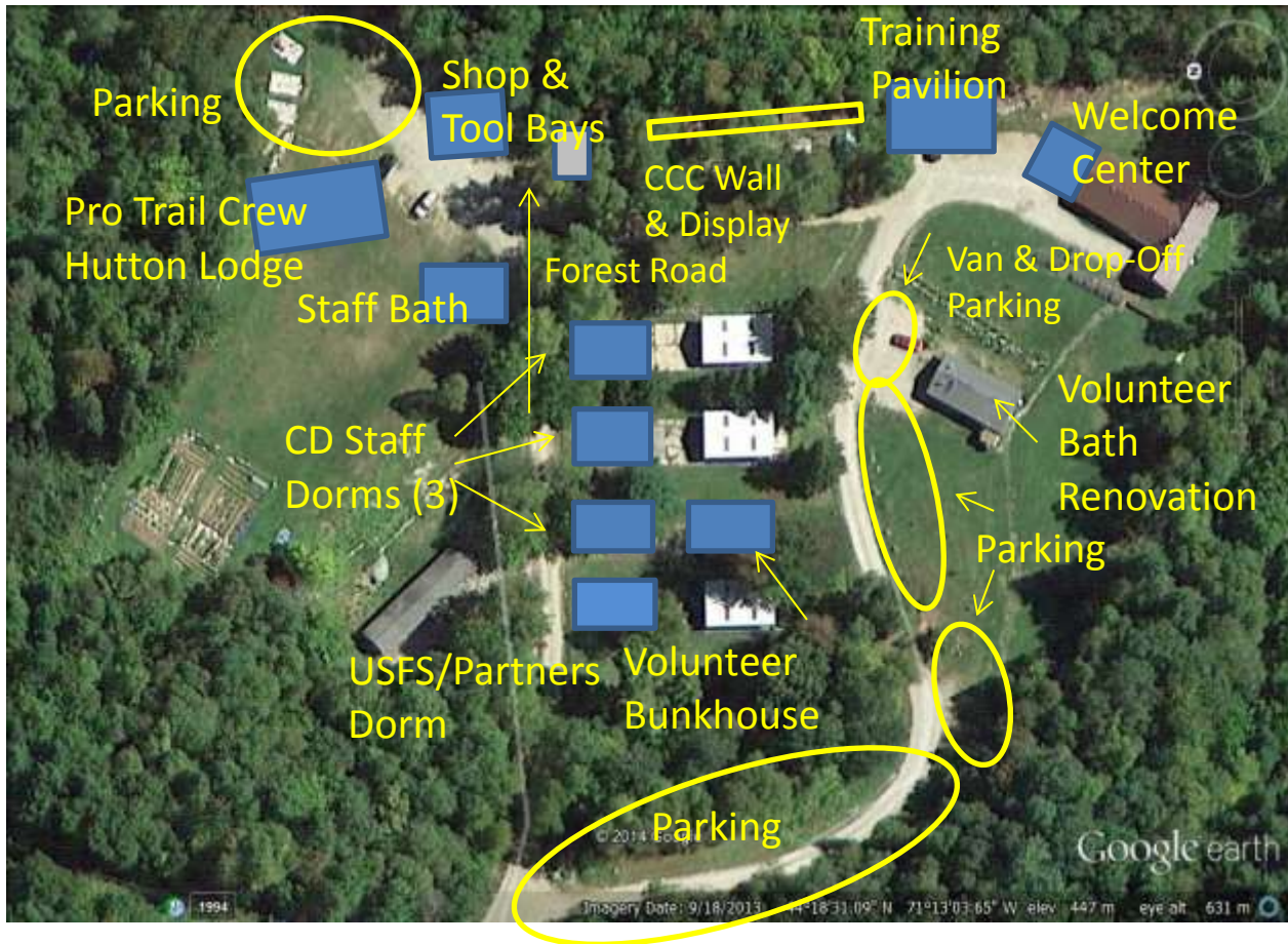
Figure 3. Camp Dodge - Proposed Action (New Facilities)