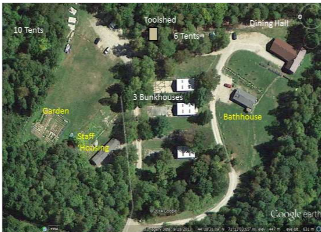
Figure 2. Camp Dodge – Proposed Action (Existing Facilities)